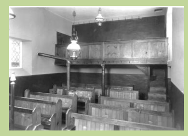
The Chapel today